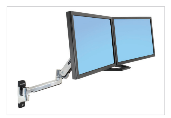
Dual Monitor & Handle Kit (#97-983) is the perfect dual-mounting solution for monitors 17" to 24"; the handle makes it easy to reposition screens