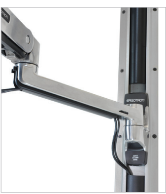
Recommended: Attach Wall Mount Arm to an Ergotron Wall Track using bracket (#97-091)